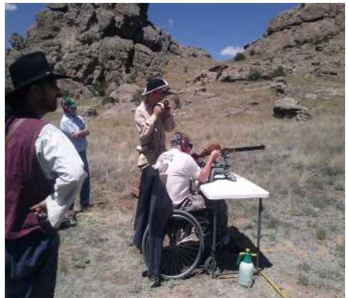
It's a blast to shoot with black powder!

We didn't have a lot (about 8 guys came) but they are sure to spread the word about what a great time they had. They even talked about going out and getting a muzzleloader now that they know how much fun they are.