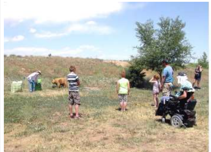
Archery instruction and shooting.