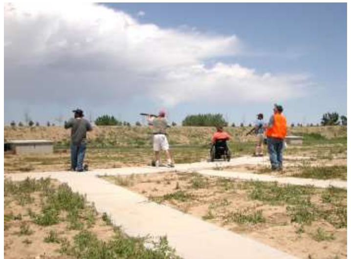
Some of the trap shooters.