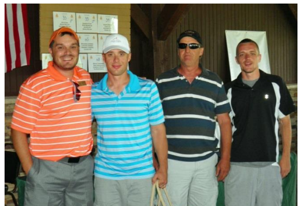
The third place team