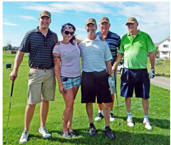
The second place team, with their Coach