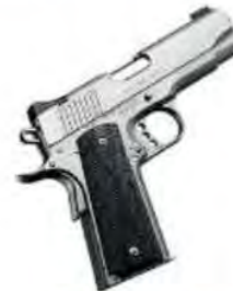
Kimber Pro Carry HD II .45 Caliber Pistol

Must pass a background check and pay for the background check.