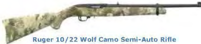
Ruger 10/22 Wolf Camo Semi-Auto Rifle