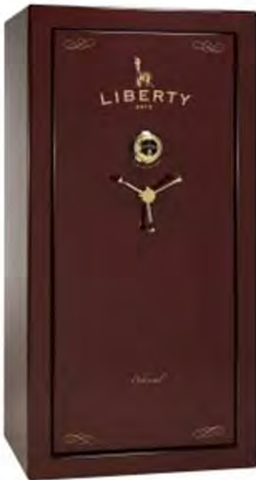
Liberty Burgundy Marble Gun Safe – Holds up to 25 Guns