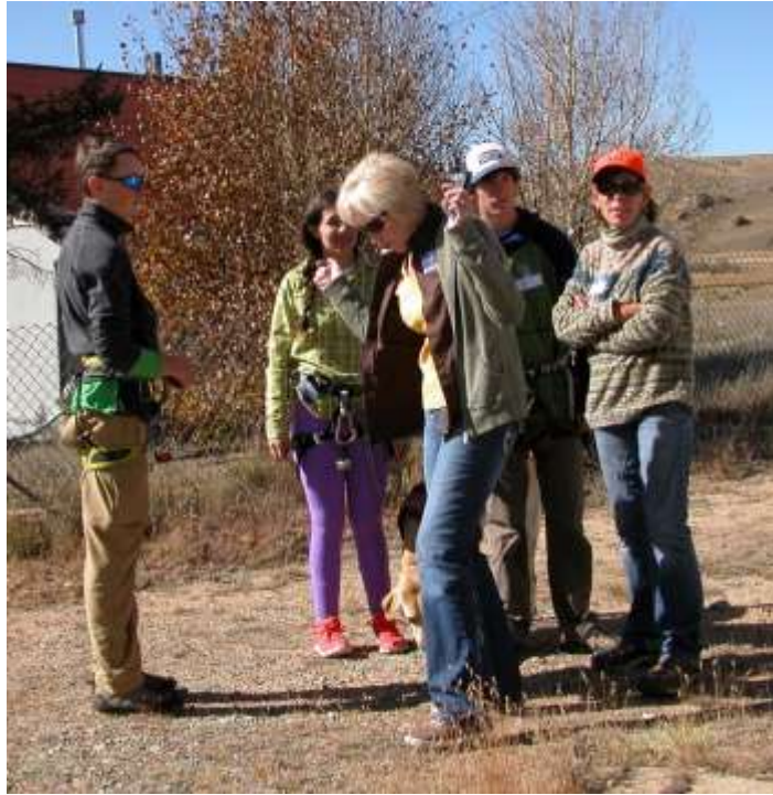
Some of the helpers.