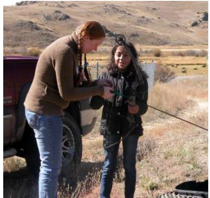
An archery lesson.