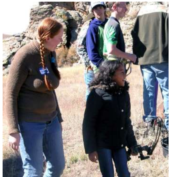
Yea; I hit the target!