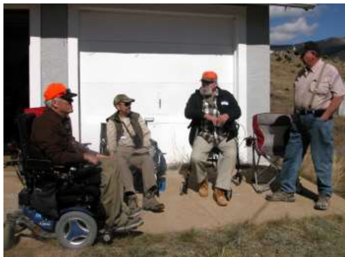
Chewin' the fat!

Even though we didn't make as many new contacts in the area as we had hoped, it seemed that everyone had fun, enjoyed the food and the good company. Thanks to all who attended.