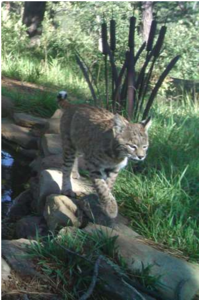
Bobcat on the loose!