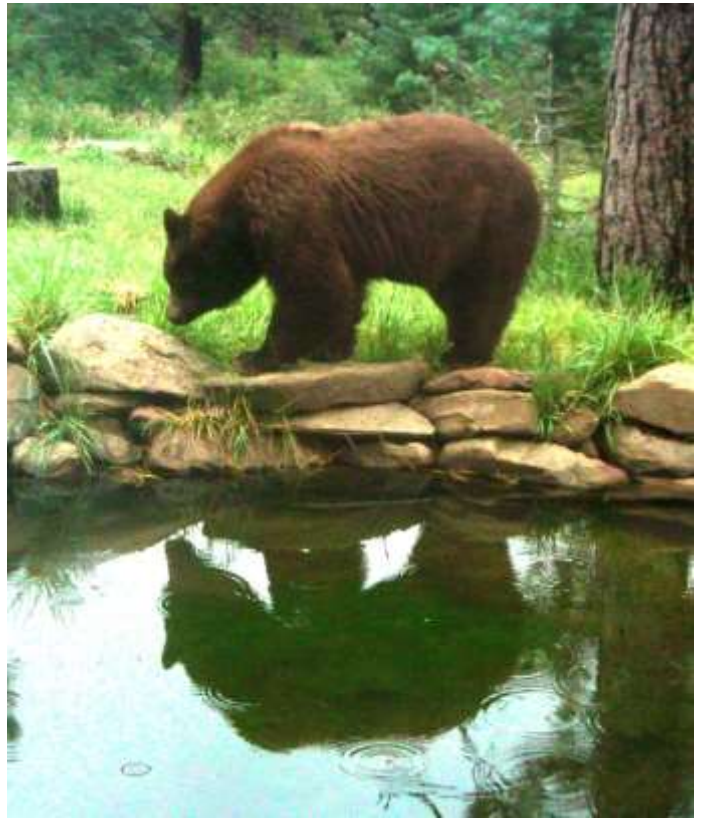
Here's lookin' at me!