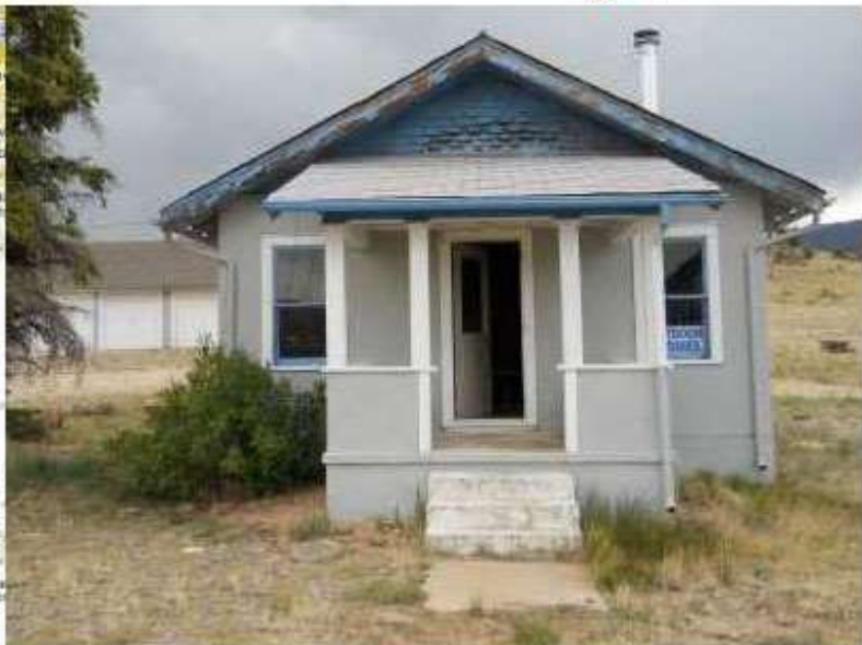
Outdoor Buddies Bunkhouse