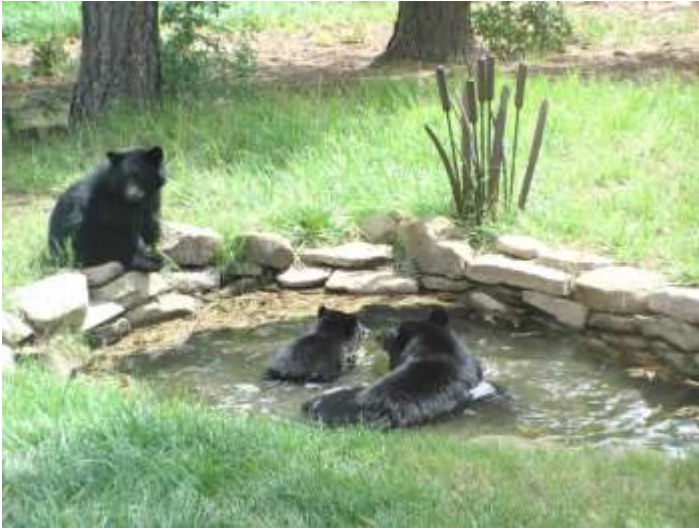
C'mon in; the water's fine!

The pictures shown here were submitted by Ann Robey. The pictures were taken recently at the Robey residence near Westcliffe.