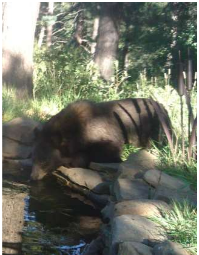
Man, was I thirsty!