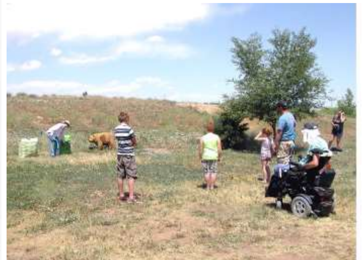
Archery instruction and shooting.