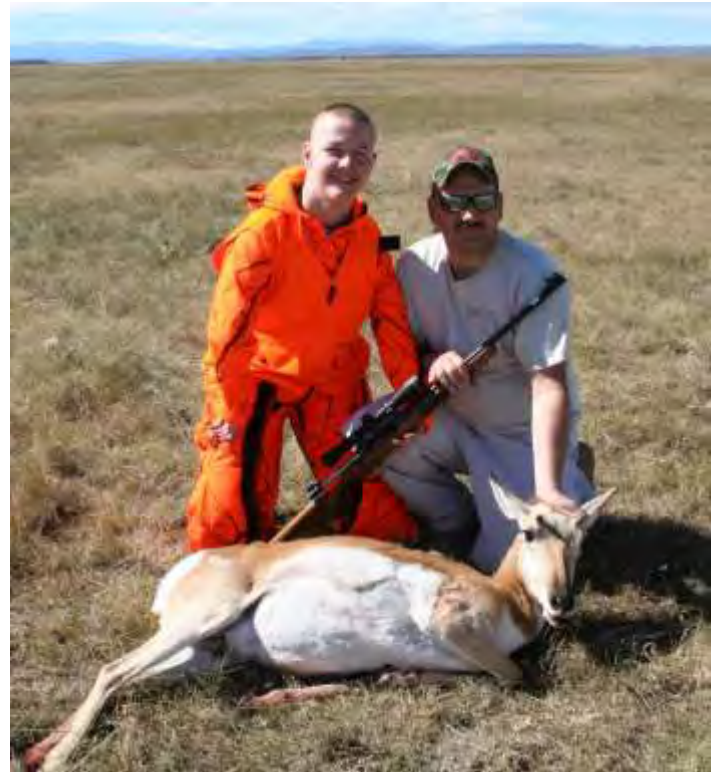
A father and son enjoying an outdoor adventure experience together!