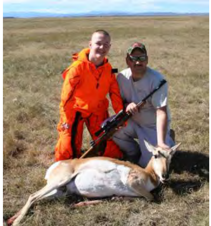
A father and son enjoying an outdoor adventure experience together!