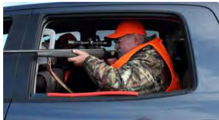
Taking Aim

After positioning me for a shot, the animal was ranged at 328 yards. I fired and the shot was just in front of her. My second shot was fired and I scored a hit and she could not run off. We approached for another shot, ranged at 231 yards, and I fired my third shot and put her down.