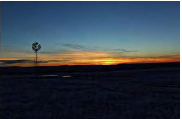
Daybreak!