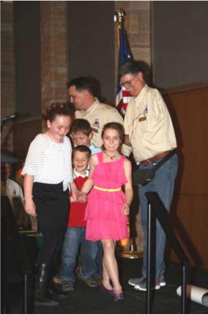
Preparing for the pledge of allegiance to the Flag of the United States of America.