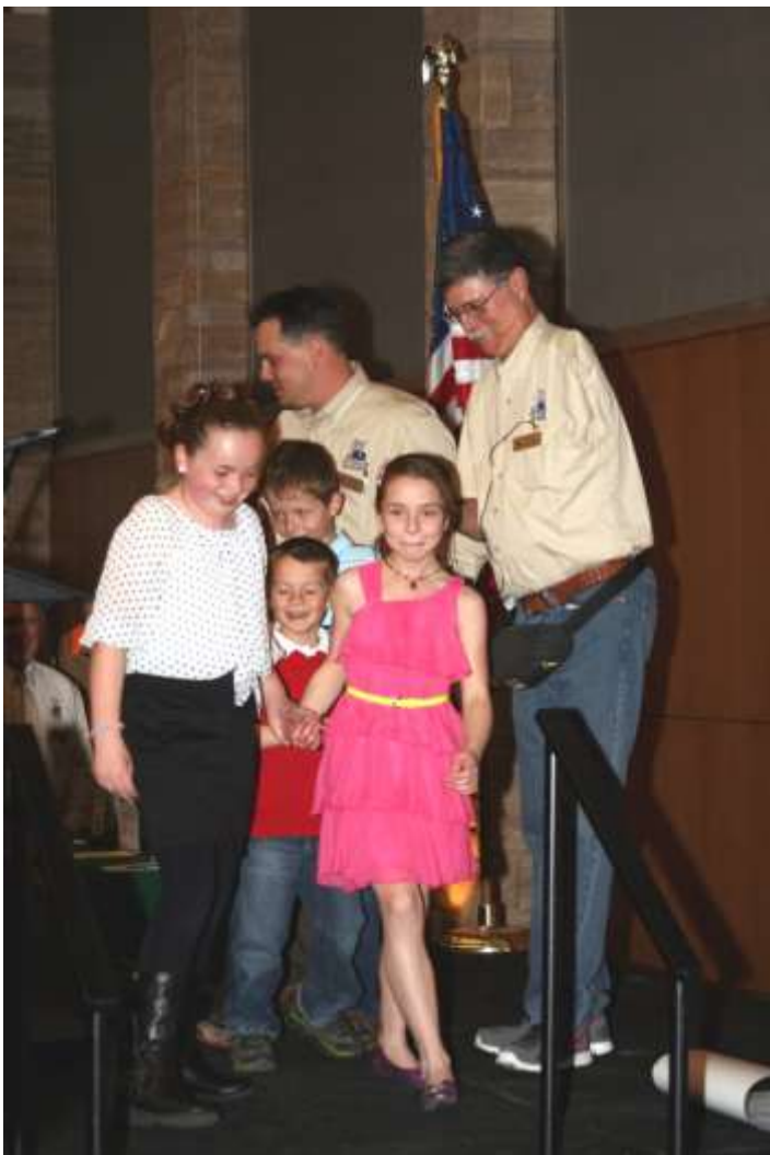
Preparing for the pledge of allegiance to the Flag of the United States of America.