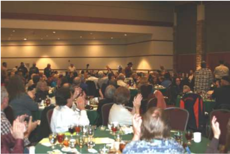
An overflow crowd enjoyed the evening.