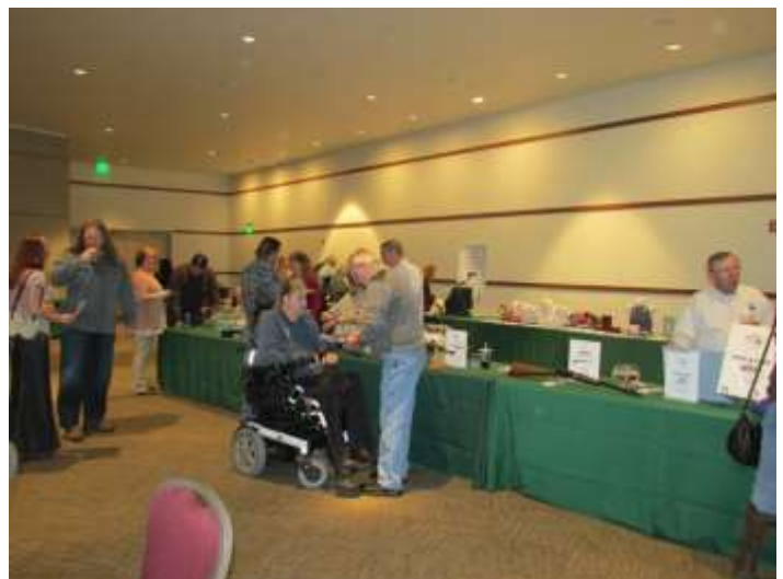
Guests inspect the silent auction items.