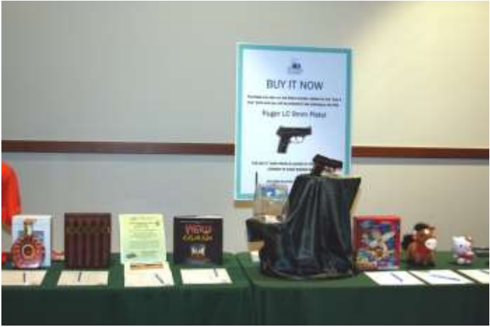
Part of the silent auction display.