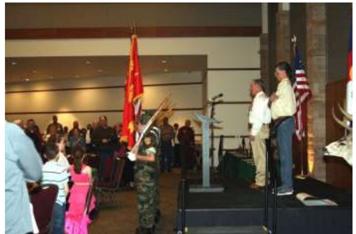
The Young Marines Color Guard presents the National Colors.

Following are a few additional pictures from the banquet.