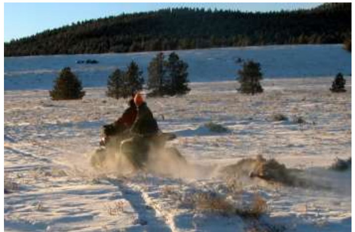
This is the easy way to get an elk to the truck!

The snow machine had no problem dragging my elk to the truck. Watching that was fun by itself.