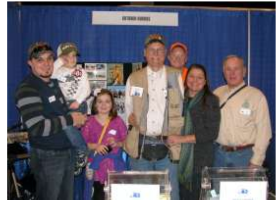
Some of the volunteers at the Outdoor Buddies booth.

space in their Youth Fair area where there are booths that provide education for young and old to learn more about Colorado and its wildlife.